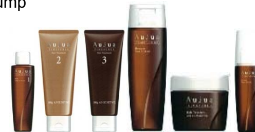
< TIMESURGE LINE >