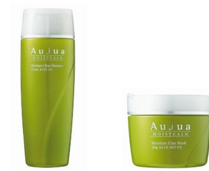
< MOISTCALM LINE >