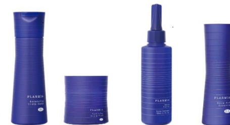
< PLARMIA New Items >