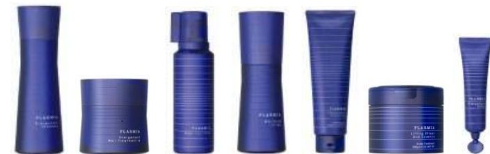
< PLARMIA >