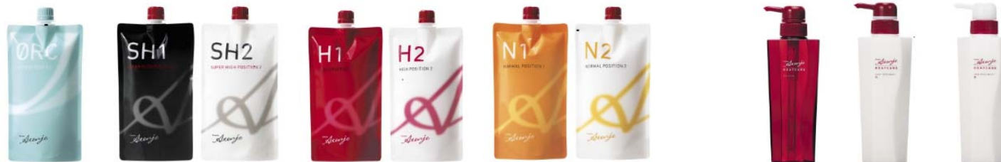
< LISCIO ATENGE STRAIGHTENING >