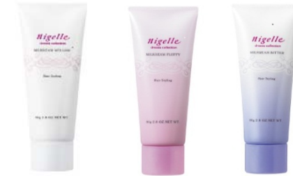
< NIGELLE DRESSIA COLLECTION MILKREAM SERIES >